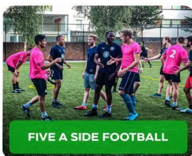
FIVE A SIDE FOOTBALL