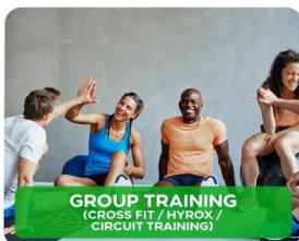
GROUP TRAINING (CROSS FIT / HYROX / CIRCUIT TRAINING)