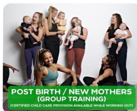
POST BIRTH / NEW MOTHERS (GROUP TRAINING) (CERTIFIED CHILD CARE PROVISION AVAILABLE WHILE WORKING OUT)