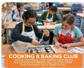
COOKING & BAKING CLUB APPLE CRUMBLE, CUP CAKES, PANCAKES, SOFTDOUGH BREAD, ALL GLUTEN FREE AND ORGANIC (4-12 YEAR OLDS)