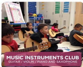
MUSIC INSTRUMENTS CLUB GUITAR / VIOLIN / PIANO AND SAXOPHONE