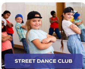
STREET DANCE CLUB