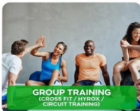
GROUP TRAINING (CROSS FIT / HYROX / CIRCUIT TRAINING)