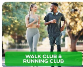
WALK CLUB & RUNNING CLUB