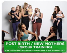
POST BIRTH / NEW MOTHERS (GROUP TRAINING) (CERTIFIED CHILD CARE PROVISION AVAILABLE WHILE WORKING OUT)