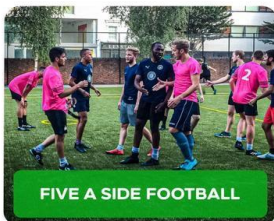
FIVE A SIDE FOOTBALL