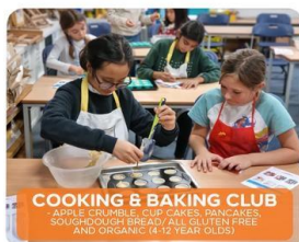
COOKING & BAKING CLUB APPLE CRUMBLE, CUP CAKES, PANCAKES, SOFTDOUGH BREAD / ALL GLUTEN FREE AND ORGANIC (4-12 YEAR OLDS)