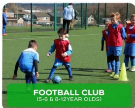
FOOTBALL CLUB (5-8 & 8-12 YEAR OLDS)