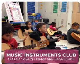
MUSIC INSTRUMENTS CLUB GUITAR / VIOLIN / PIANO AND SAXOPHONE